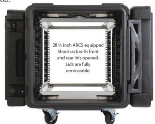
28 1/4 inch ARCS equipped Shockrack with front and rear lids opened. Lids are fully removable.