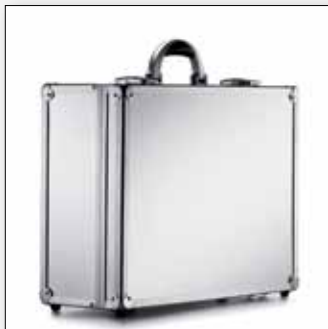
90100, 90300, 90600, 90700, 90800