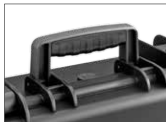
Ergonomically formed two-component handle with soft insert for a comfortable carrying.

In addition to that the new Outdoor Case offers various options: It is besides the black or yellow standard version also available in other colors with detachable hinges* for the removable lid. Furthermore we supply a pick & plug foam, a padded divider, a carrying strap, a lid pocket, and a back-pack system. The interior is shapeable as well.