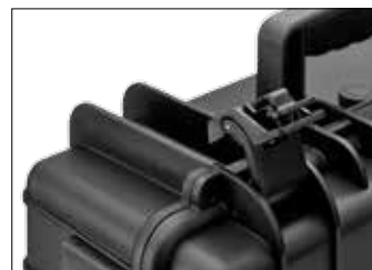
Two-stage lock – easy opening with one hand.