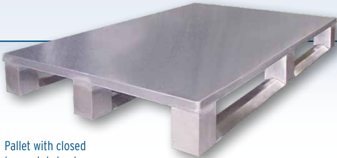
Pallet with closed top metal sheet