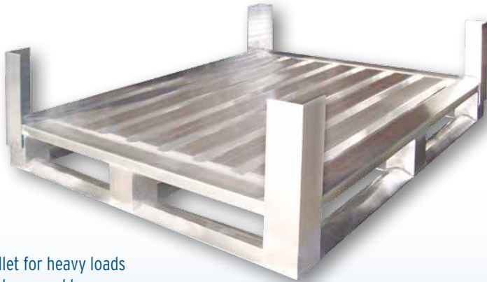
Pallet for heavy loads with crossed base