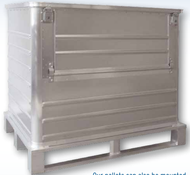
Our pallets can also be mounted as bases on our tried-and-tested GMÖHLING products.