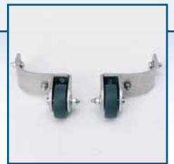
Model A 1599 / 105 R